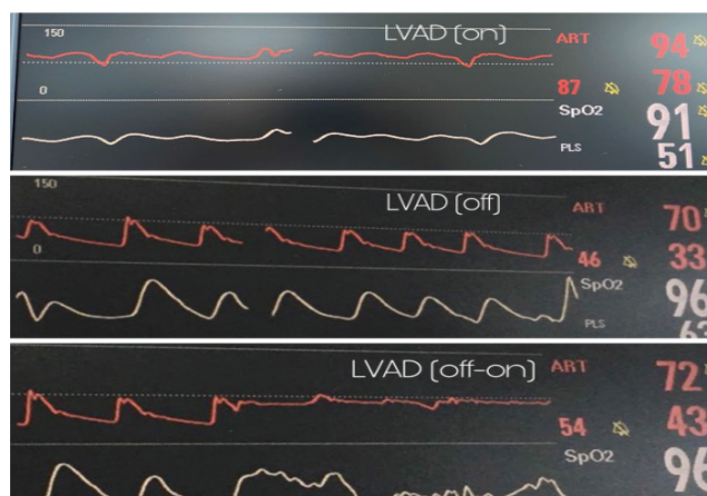
Fig.3 LVAD on-off-on

The hemodynamic were stable throughout the intervention. The debit of the LVAD pump was good, providing a satisfactory perfusion with an average