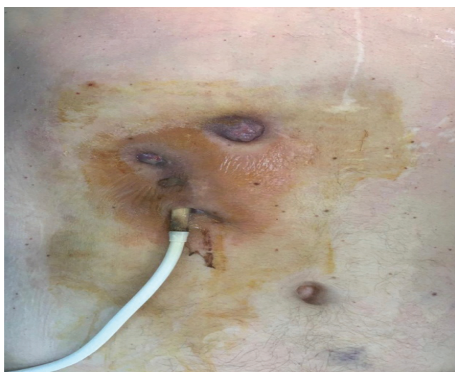
Fig.2. Infection on cable insertion

Initially with Ceftriaxone (IM) according to the antibiogram for positive culture against Staphylococcus spp in June 2019. In the following months the patient is presented again in hospital with positive wound culture for Pseudomonas aeruginosa . It is tried to be treated on an outpatient basis according to the antibiogram with Ciprofloxacin but no significant improvements were seen in the follow up. The patient is hospitalized and the culture is positive for Pseudomonas Aeruginosa .